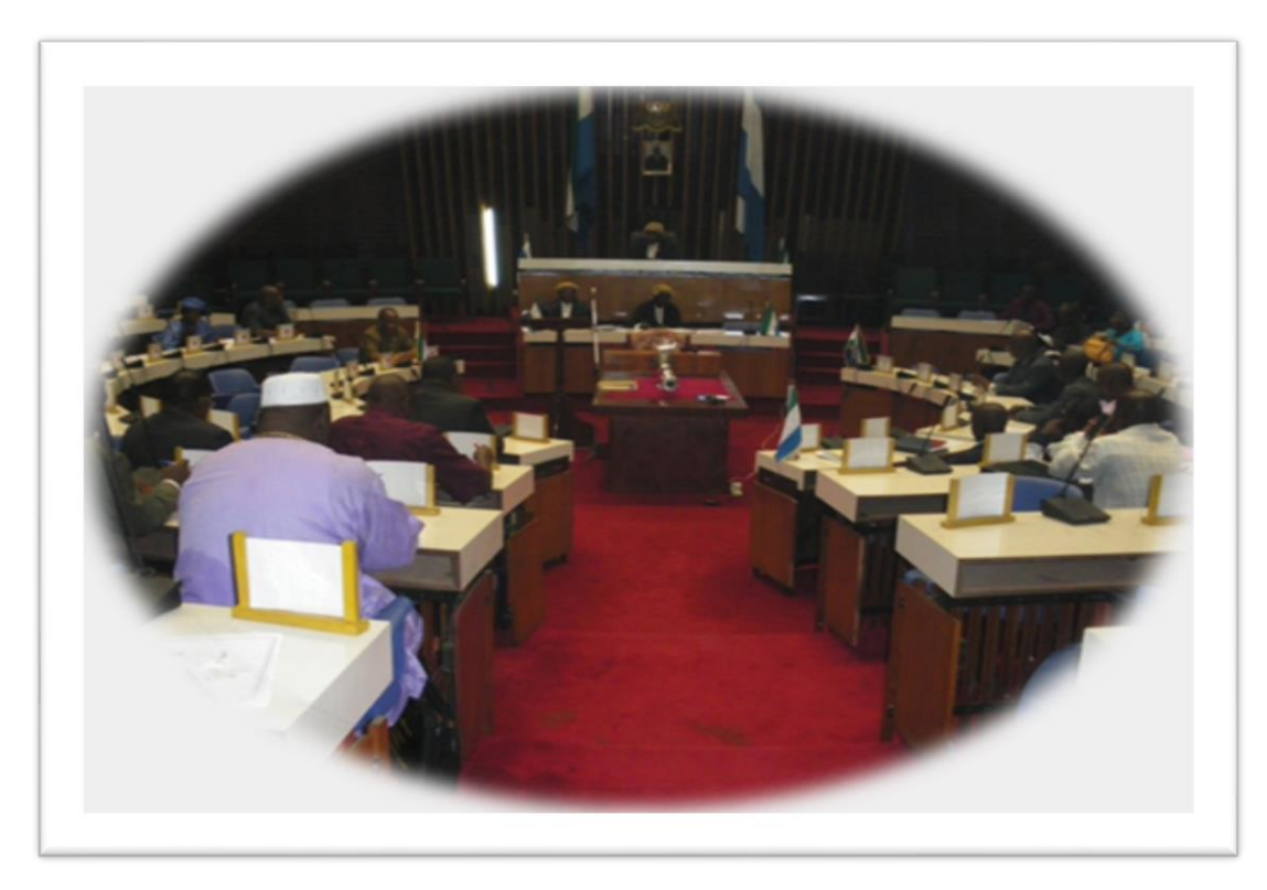
THE CHAMBER OF PARLIAMENT OF THE REPUBLIC OF SIERRA LEONE